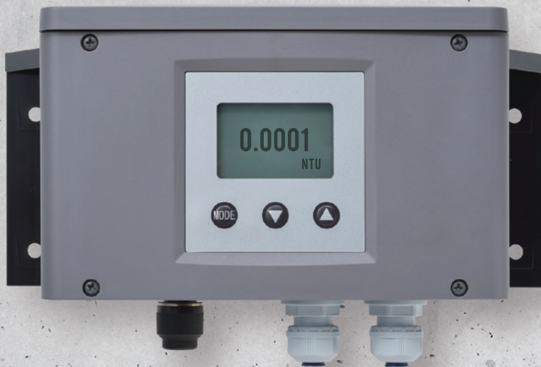
Ultra Low Turbidity Checker

Measure turbidity to four decimal places. It enables you to monitor the quality of water which is good to drink or not.